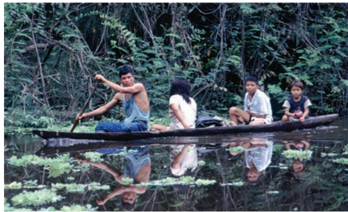
Life on the Amazon for a Matsigenka family in Peru.

We address questions like these and others in this book. We tackle fundamental questions: How in the world does a single fertilized egg cell turn into a unique human being? How do