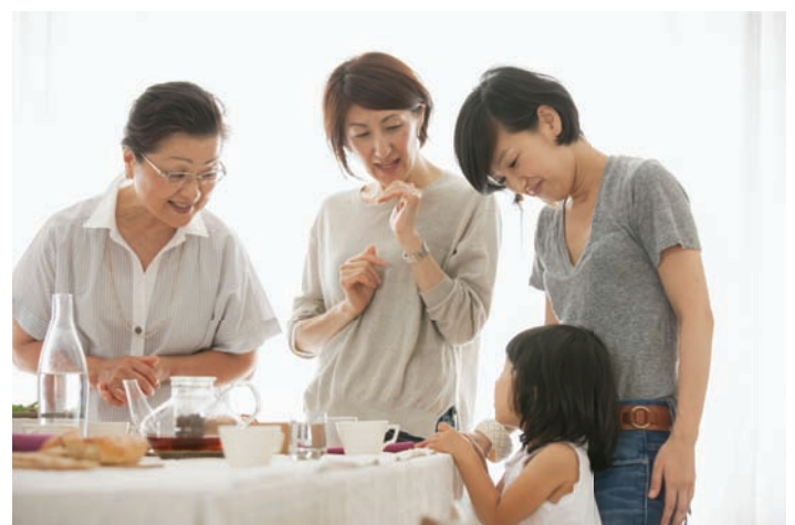
What periods of the life span do these four females, representing four generations of the same family, fall in?

The most recent addition to this list of periods of the life span—the one you may not have heard of—is emerging adulthood , a transitional period between adolescence and full-fledged adulthood that extends from about age 18 to age 25 and maybe as late as 29. After World War II, as jobs became more complex and required more education, more adolescents began to attend college in large numbers to prepare for work and postponed marriage and parenthood in the process (Keniston, 1970). As a result, psychologist Jeffrey Arnett and others began to describe emerging adulthood as a distinct phrase of the life span in which college-aged youth spend years getting educated and saving money in order to launch their adult lives (Arnett, 2000, 2011, 2015). Emerging adulthood is a distinct developmental period primarily in developed countries but the phenomenon is